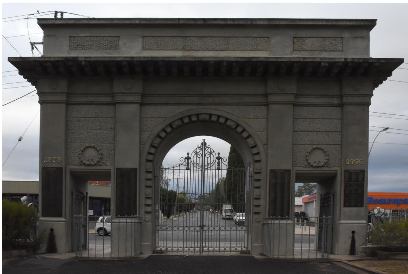
Bega Soldiers Memorial Gates