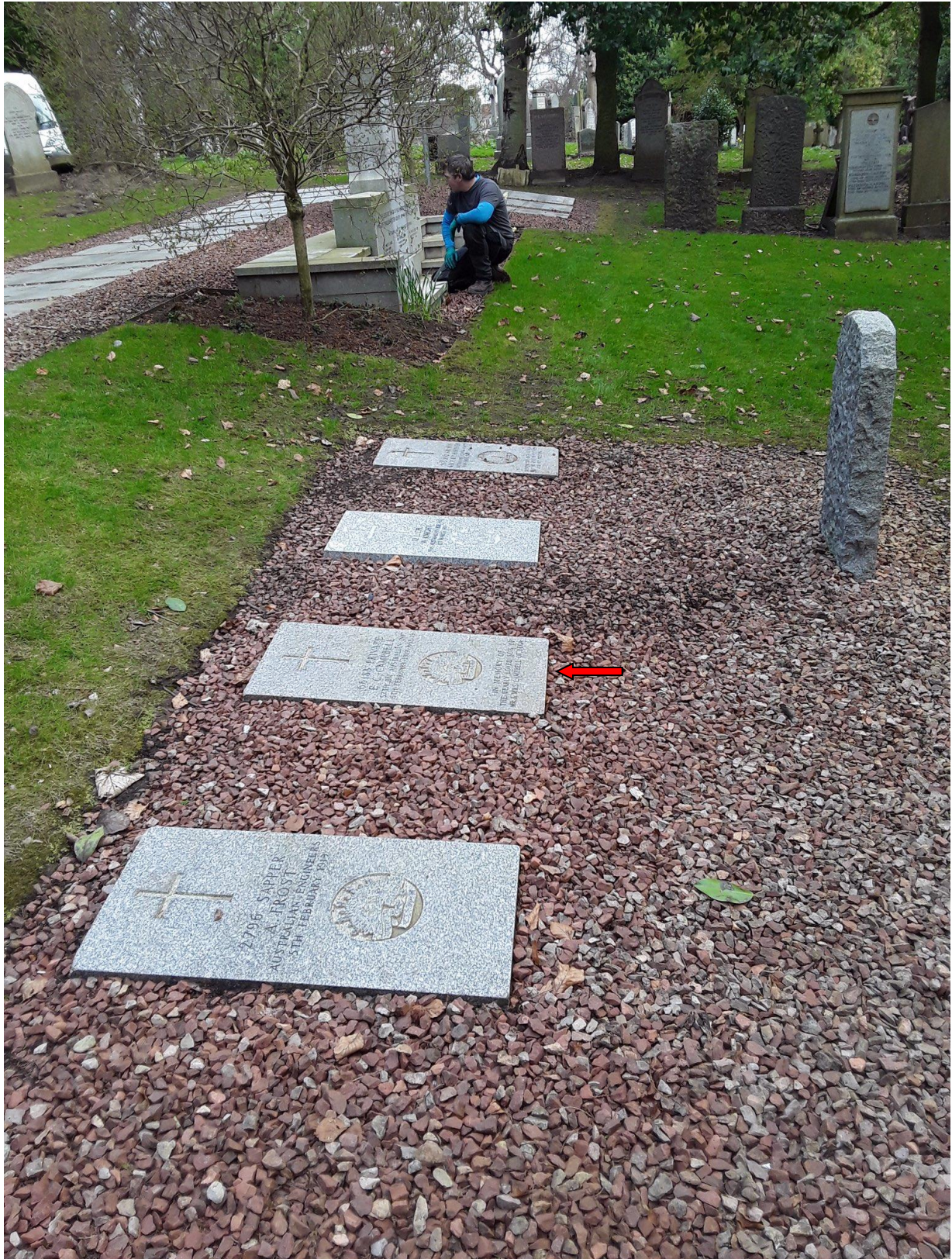
Private Campbell's headstone (see arrow)